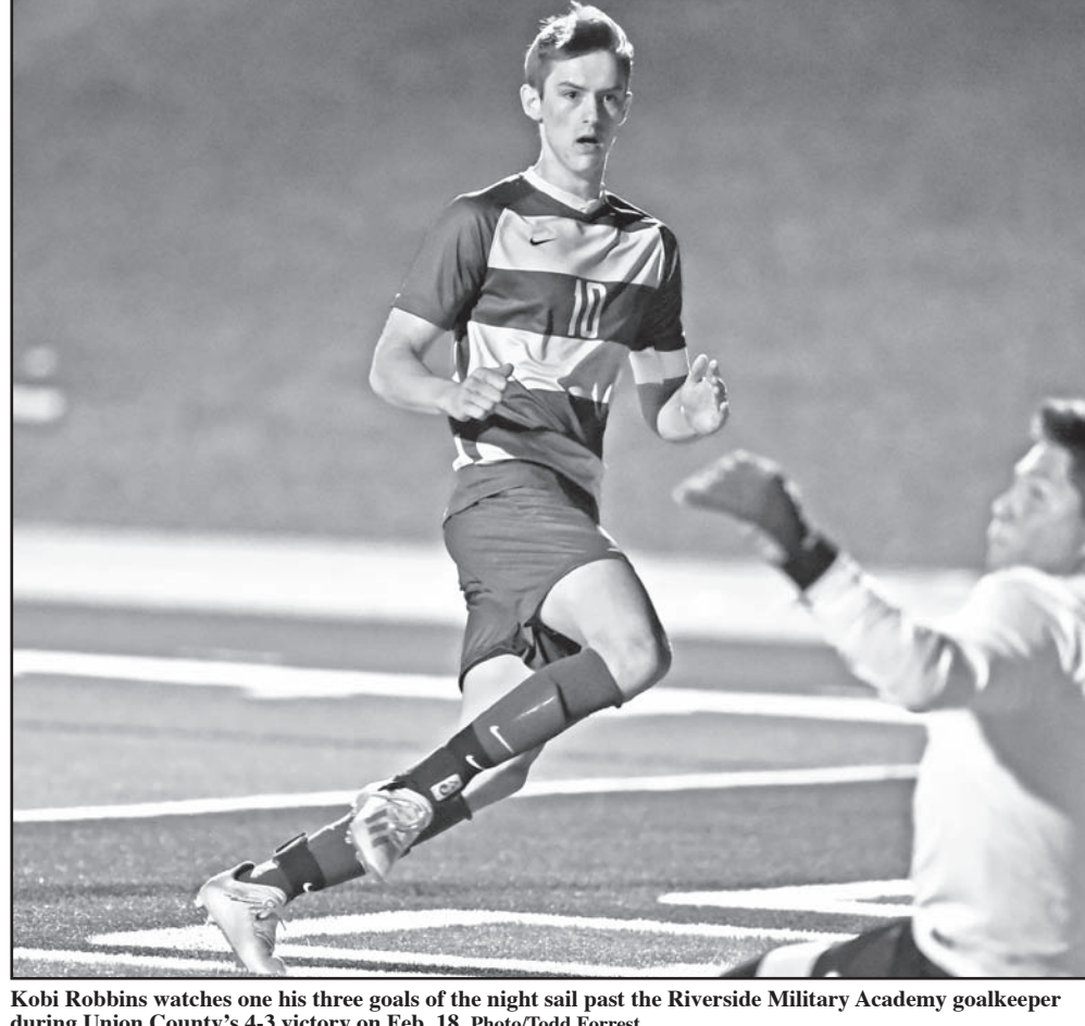
during Union County's 4-3 victory on Feb. 18.